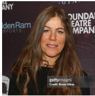
Marci Klein NBC Universal