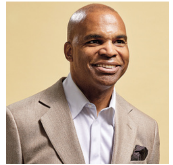
Tommy Amaker Head Men's Basketball Coach, Harvard University