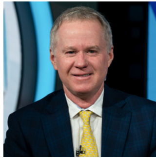
Patrick McEnroe President