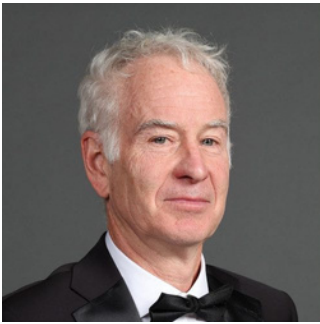
John McEnroe Founder